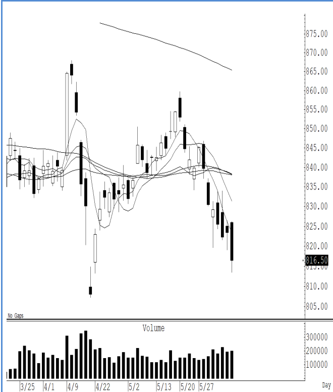
S50M24 (Close 816.50 Chg -7.0)